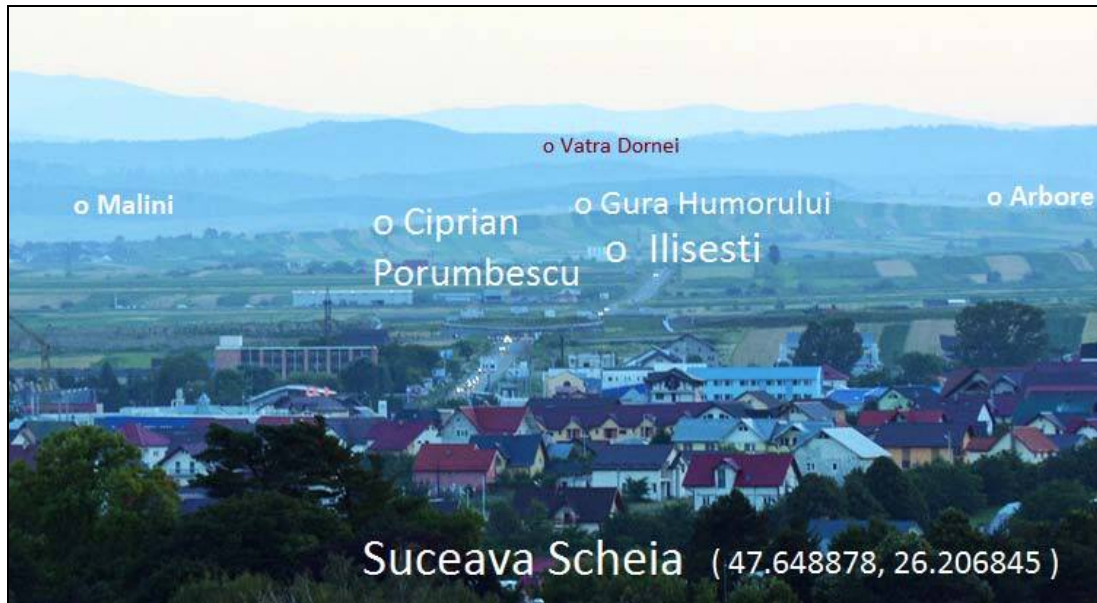
FIG.1. Information on the point of interest superposed on the image captured with the camera of the mobile device

On the other hand, meaningful linguistic data achieved in the project will be stored in public archives to be useful for future research, that will handle the implementation / development of processing technologies of the Romanian language, as well as the development of electronic dictionaries. An example of this is the extensive list of Romanian geographical names acquired during the project, which will become instances of the Romanian WordNet [3] concepts. Moreover, the structure, content and design of hypermaps will be contextualized. The project has created an inventory of public information and educational tourism in a catalogue metadata space by using geocoded public data available.