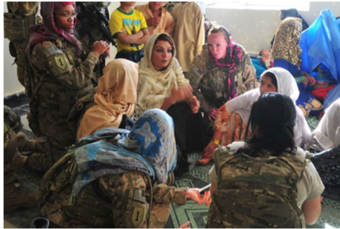
FIG. 2 FET teams interacting with the local female population

The FET has been able to demonstrate its usefulness in the missions in Afghanistan. There are various reasons that demonstrate their need, such as the need to use female personnel in a visible way, the need to show that the military addresses gender issues, and the effectiveness demonstrated during the missions.