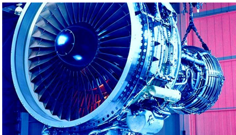
FIG. 3. Pratt & Whitney PW2000 engine with fan blades from MMC [13]

Another example of using metal composites such as MMC in military aviation is a heavy transport plane Boeing C-17 Globemaster III. In the construction of the aircraft manufacturer used MMC composite based on the alloy TiAl6V4 and continuous fibre made of silicon carbide. This material has been used in turbine aircraft engine – Fig. 3 [13].