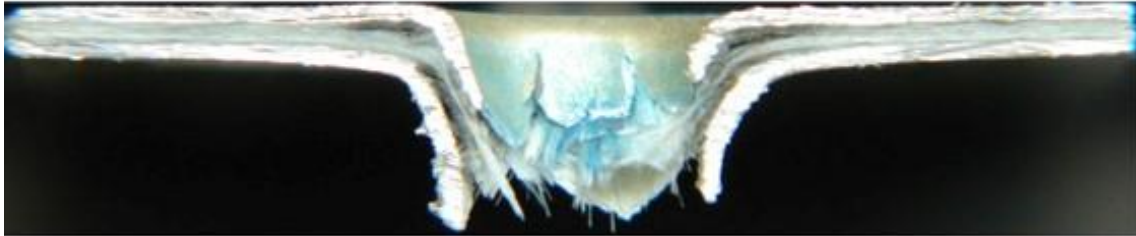
FIG. 2. Cross-section of bullet hole in GLARE [9, 10]

In view of its specific properties the GLARE became the subject of research in the context of military aviation. During the bullet hole caliber 16.5 mm, penetrating an obstacle with composite GALRE with the speed of 171 m/s there was observed only local destruction at the site of impact of the projectile and its area – see in Fig. 2 [9, 10].